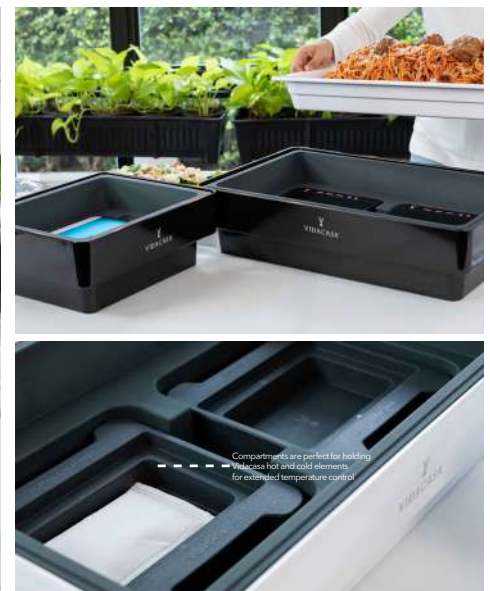
Compartments are perfect for holding VIDACASA hot and cold elements for extended temperature control