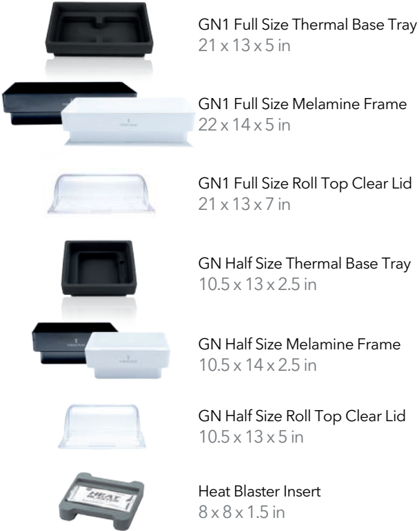
GN1 Full Size Thermal Base Tray 21 x 13 x 5 in